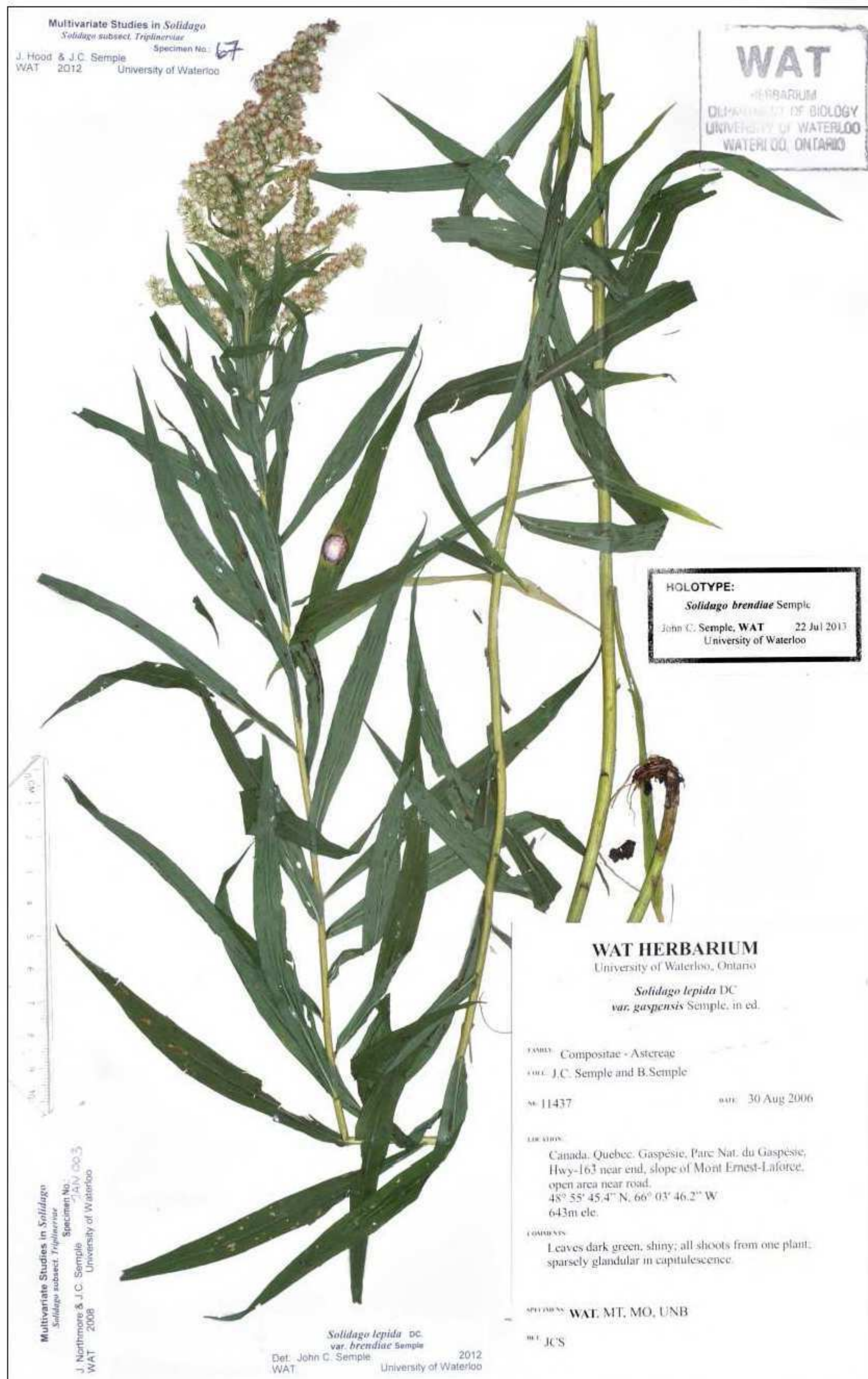
Figure 1. Holotype of Solidago brendiae (WAT)